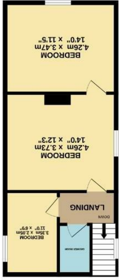
1ST FLOOR 44.0 sq.m. (474 sq.ft.) approx.

15-17 Eastgate Street, Bury St. Edmunds, Suffolk, IP33 1XX T: 01284 760770 E: bury@shiresstateagents.co.uk